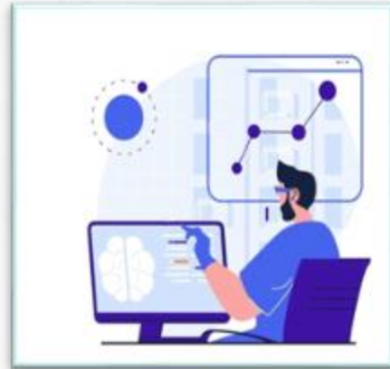
Computer Science Technician