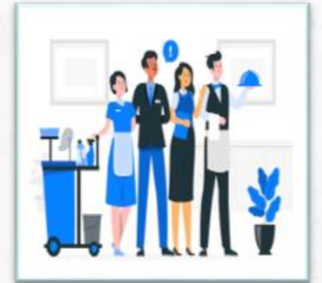
Hotel Management and Hospitality